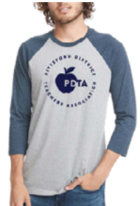
(Sleeves are Midnight Navy)